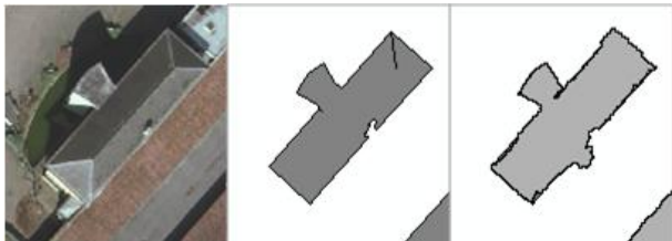
Figure 2: Left: the DMC image, middle: an exemplar reference building (1 out of 37), and right: an exemplar segmentation result.

* For all segments having their centroid within a reference polygon, the number of pixels on the wrapping perimeter is determined. Next, the cumulative distribution per segmentation run (number of pixels in relation to the distance from the reference perimeter) is calculated.